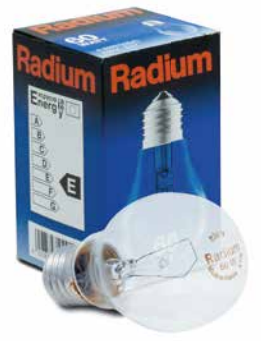
Lightbulb Radium clear (10 pack)