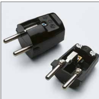
Earthing contact plug Duroplast black Black Duroplast. 250 V, 16 A, 50 Hz. Only suitable for alternating current. Ø 38 mm. Length 60 mm. Weight 40 g. Product code 139447