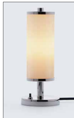
Table light triplex opal glass

The design of the table lamp probably originates from a draft version by Wolfgang Tümpel, whose metalwork from the golden days of Burg Giebichenstein and Weimar Bauhaus today sells for high prices at auctions. We had an original made of sheet steel and window glass. Its modest execution testified to the scarcity of materials in the years shortly after the First World War. We now have the base of the table lamp cast from brass and the glass cover turned from the same material, which gives it a stable weight of 1.2 kg. The cylinder of handblown triplex opal glass with a diameter of eight centimeters requires the use of candle light bulbs (E14). The table lamp and the wall lamp we derived from it are beautiful testimonies of a design approach that allows the traditional forms (here: the candlestick) to resonate in new technical worlds (here: electric light) in a sober and non-sentimental manner.