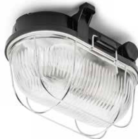
Basement lamp THPG Bakelite oval large Length 195 mm, width 135 mm, height 115 mm. Weight 700 g. Porcelain socket E27, max. 100 W. IP54. Product code 100501