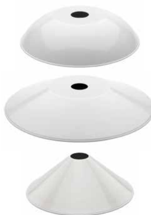
Shade sheet steel round bent white

Ø 240 mm, height 85 mm. Product code 101214