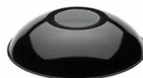
Shade sheet steel round bent black Ø 260 mm, height 60 mm. Product code 101252

Please see page 9 for suitable canopies and cables of different colours and lengths.