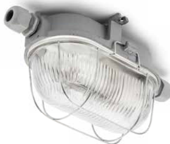
Basement lamp THPG cast iron oval large Length 195 mm, width 135 mm, height 115 mm. Weight 1700 g. Porcelain socket E27, max. 100 W. IP54. Product code 100506