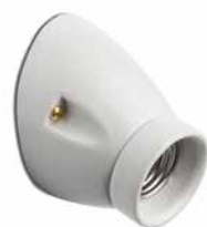
Wall socket THPG MINIMAL porcelain white

Bevelled three-piece porcelain socket with shade holder. Max. Ø 75 mm. Projection 85 mm. Weight 200 g. Product code 152647