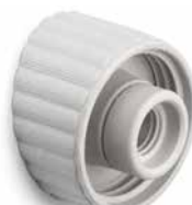
Wall-mounted base THPG porcelain M Ø 106 mm, projection 60 mm. Product code 177027