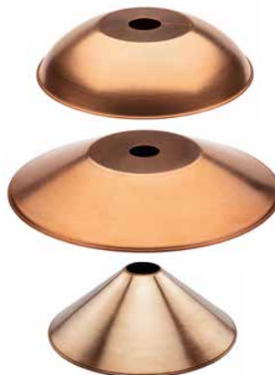
Shade copper round bent

Black Bakelite socket with black 1.5 m textile cable. E27, max. 60 W. With strain relief and pull switch. Product code 101180