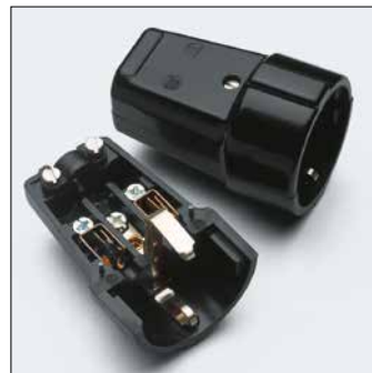
Earthing contact connector Duroplast black Black Duroplast. 250 V, 16 A, 50 Hz. Only suitable for alternating current. Ø 50 mm. Length 70 mm. Weight 68 g. Product code 139448