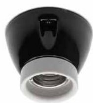
Ceiling socket THPG MINIMAL porcelain black, with white shade holder

Straight three-piece porcelain socket with shade holder. Max. Ø 75 mm. Height 60 mm. Weight 200 g. Product code 152649