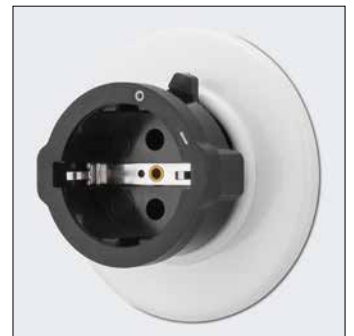
Switchable intermediate earthing contact plug THPG Duroplast black Black Duroplast. 230 V, 16 A, 50 Hz. Only suitable for alternating current. Ø 50 mm. Length 45 mm. Weight 50 g. Product code 100477