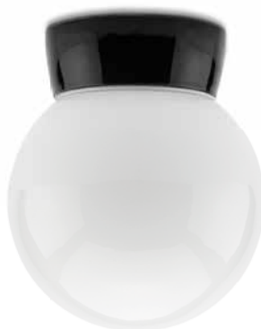
Ceiling and wall light THPG porcelain black (page 6)