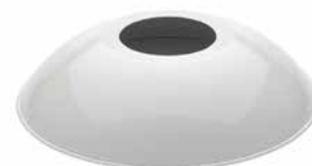
Shade sheet steel round bent white Ø 260 mm, height 60 mm. Product code 101253