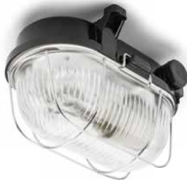
Basement lamp THPG Bakelite oval small Length 170 mm, width 125 mm, height 115 mm. Weight 550 g. Porcelain socket E27, max. 60 W. IP54. Product code 100500