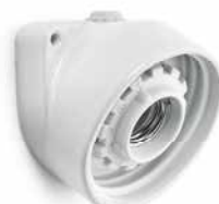
Wall-mounted base LISILUX white M Ø 95 mm, projection 60 mm. Product code 100758