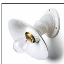
Lights from Veneto Page 18-19