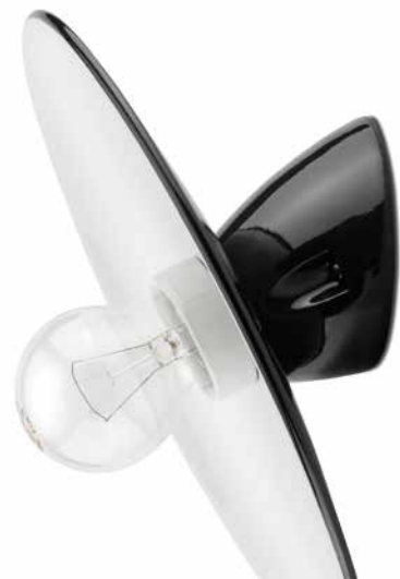
Wall socket MINIMAL porcelain b/w (152656) with Shade enamelled sheet steel black small (101089)

Here you can combine three of our MINIMAL pendant lamps presented on page 9 as well as our MINIMAL wall and ceiling sockets made of porcelain with eleven different copper and sheet steel shades. The 1.5 metre long cable of the pendant lights can be replaced with a different colour and the length can be adjusted. These options and matching porcelain canopies can be found on page 9.