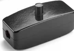
Cord switch THPG Bakelite with black push-button Product code 100465