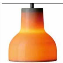
Danish porcelain lamps Page 16