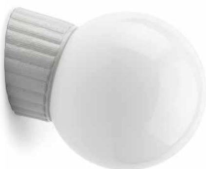
Wall light THPG porcelain M sphere opal

Bevelled black porcelain base. Spherical glass Ø 150 mm. Projection 195 mm. Weight 880 g. Socket E27, max. 60 W. IP20. Product code 177037