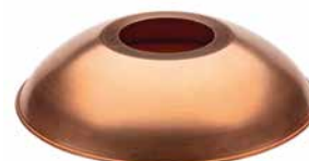
Shade copper round bent Ø 260 mm, height 60 mm. Product code 101205