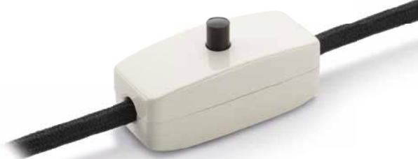
Cord switch THPG Duroplast cream with black push-button Product code 101262