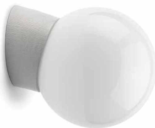
Wall light THPG porcelain L sphere opal

Porcelain base. Spherical glass Ø 150 mm. Projection 195 mm. Weight 1260 g. Socket E27, max. 60 W. IP20. Product code 177031