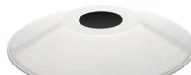
Shade sheet steel flat white Ø 350 mm, height 50 mm. Product code 101257