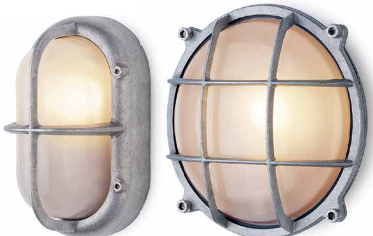
Wall light aluminium round Ø 210 mm, depth 95 mm. Weight 1100 g. Porcelain socket E27, max. 60 W. IP45. Product code 165252