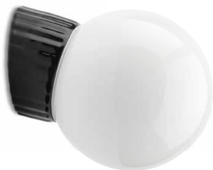
Wall light THPG porcelain black M sphere opal

Bevelled black porcelain base. Spherical glass Ø 150 mm. Projection 195 mm. Weight 880 g. Socket E27, max. 60 W. IP20. Product code 177037