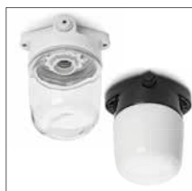
LISILUX lights Page 3-5