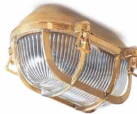
Basement lamp brass small Length 200 mm, width 130 mm, height 105 mm. Weight 1300 g. Porcelain socket E27, max. 60 W. IP54. Product code 130748

This heavy, robust lamp is cast in Italy from brass. It is actually (not only visually) suitable for the extreme demands of rough seafaring: the housing and protective cage are made of solid, polished brass, absolutely resistant to corrosion and weathering.