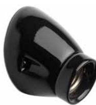
Wall socket THPG MINIMAL porcelain black

Bevelled three-piece porcelain socket with shade holder. Max. Ø 75 mm. Projection 85 mm. Weight 200 g. Product code 152647