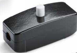
Cord switch THPG Bakelite with white push-button Product code 100466