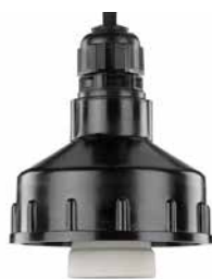
Pendant lamp THPG Bakelite M Max. 60 W. Porcelain socket E27. Product code 101183

The bases and sockets which you have already seen on the previous pages are the basis of the THPG light kits. These can be divided into two groups based on the diameter of their internal threads: MINIMAL and MEDIUM. The MINIMAL bases can be combined with matching shades (next double page), the MEDIUM bases with matching shades and glasses (on this page). If you also select your favourite cables and canopies, you can create customised lamps that differ significantly from one another in terms of design and light pattern. A variation in detail is often enough to create a different overall impression or to better integrate the lamp into its future surroundings.