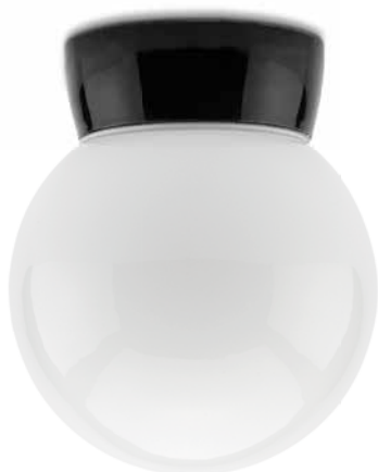
Ceiling light THPG porcelain black M sphere opal

Porcelain base. Spherical glass Ø 180 mm. Projection 210 mm. Weight 1260 g. Socket E27, max. 60 W. IP20. Product code 177033