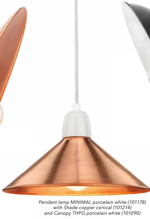
Pendant lamp MINIMAL porcelain white (101178) with Shade copper conical (101214) and Canopy THPG porcelain white (101090)