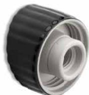
Wall-mounted base THPG porcelain black M Ø 106 mm, projection 60 mm. Product code 177035