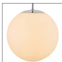
Triplex opal glass lamps Page 17