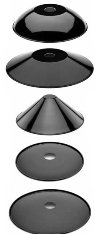
Shade sheet steel round bent black

Bevelled three-piece porcelain socket with shade holder. Max. Ø 75 mm. Projection 85 mm. Weight 200 g. Product code 152656