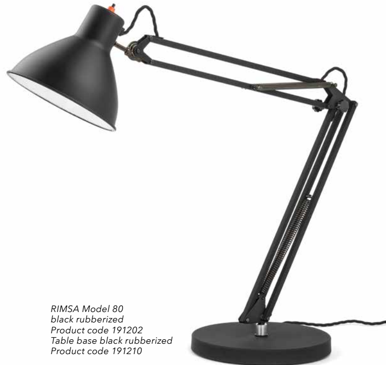
RIMSA Model 80 black rubberized Product code 191202 Table base black rubberized Product code 191210