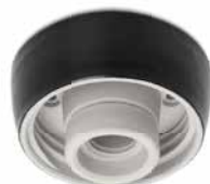
Ceiling-mounted base THPG porcelain black M Ø 108 mm, height 60 mm. Product code 177034