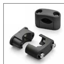
Accessories and spare parts Page 24-25