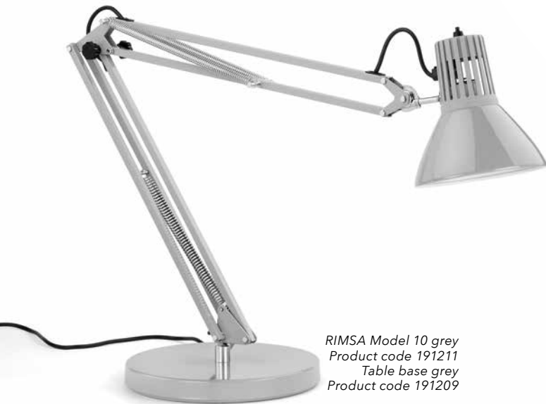
RIMSA Model 10 grey Product code 191211 Table base grey Product code 191209

We offer the Italian original, which is still produced today by RIMSA, an Italian manufacturer that builds for us "new originals" of its balanced-arm lamps from 1946 and 1964. The lamp head can be swivelled generously thanks to a patented steel articulated socket at the upper end of the arm, which has been in production since 1946. The light cone can be easily and continuously fixed at almost any angle to illuminate the desired location with centimeter precision. Please order the lamp in the colour of your choice, along with a suitable mount.