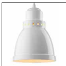
THPG pendant lamps and spotlights Page 7 & 10-11