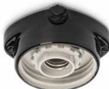
Ceiling-mounted base LISILUX black M Ø 95 mm, height 50 mm. Product code 101247