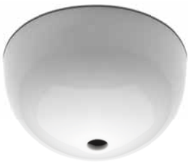
Canopy THPG porcelain white White glazed porcelain hemisphere. Ø 95 mm, height 55 mm.