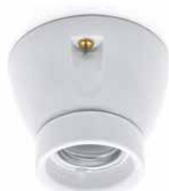
Ceiling socket THPG MINIMAL porcelain white

Ø 240 mm, height 85 mm. Product code 101259