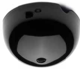
Canopy THPG porcelain black Black glazed porcelain hemisphere. Ø 95 mm, height 55 mm.

Porcelain white with side cable entry Product code 101194