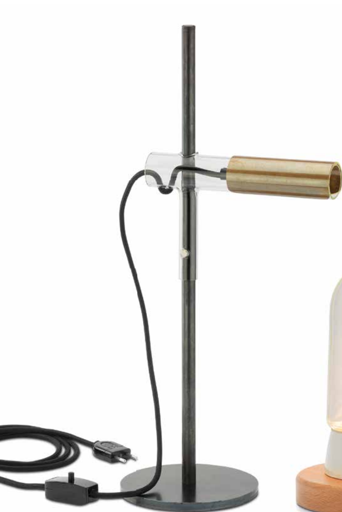
Glass tube lamp THPG (page 13)