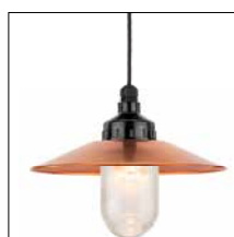
Light kits Page 20-23