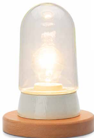
THPG pedestal lamps (page 14)