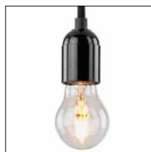
THPG MINIMAL lights Page 8-9