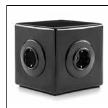
Power strips Page 26