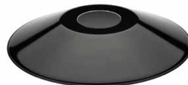
Shade sheet steel flat black Ø 350 mm, height 50 mm. Product code 101256