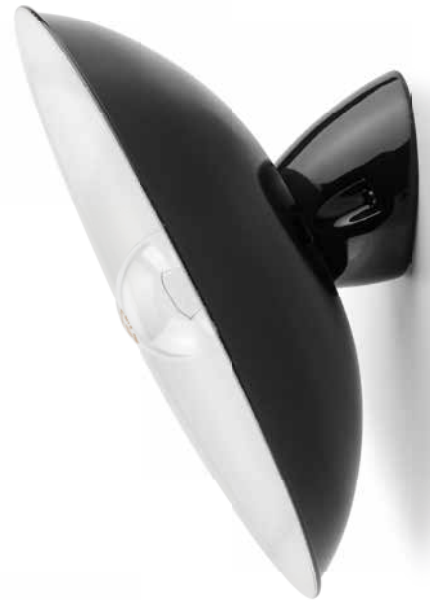
Wall socket MINIMAL porcelain black (152651) with Shade sheet steel round bent black (101250)