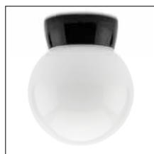
THPG porcelain lights Page 6