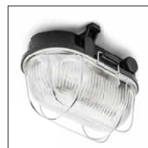
Basement and outdoor lamps Page 12