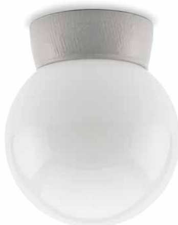
Ceiling light THPG porcelain M sphere opal

Porcelain base. Spherical glass Ø 150 mm. Total height 190 mm. Weight 850 g. Socket E27, max. 60 W. IP20. Product code 177030