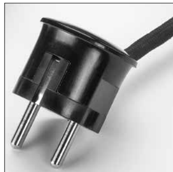
Angled earthing contact plug Duroplast black Black Duroplast. 250 V, 16 A, 50 Hz. Only suitable for alternating current. Length 52 mm. Weight 46 g. Product code 100870