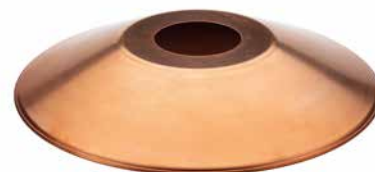
Shade copper flat Ø 350 mm, height 50 mm. Product code 101211