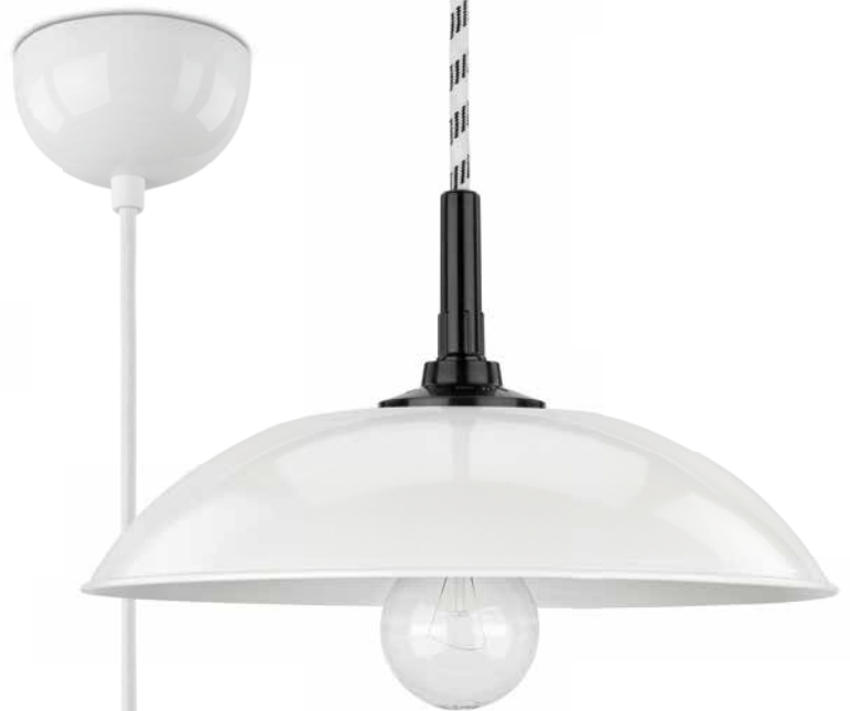
Pendant lamp MINIMAL Bakelite with shade holder (900534) and Shade sheet steel round bent white (101251)