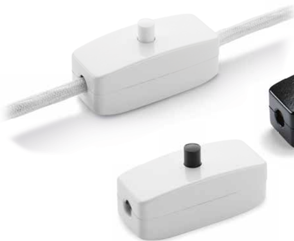
Cord switch THPG Duroplast white with white push-button Product code 101261

2 A, 250 V, single-pole, with connecting terminal for neutral and earth conductor. For three-core cables, with strain relief clip. Length 60 mm, height 23 mm (incl. push-button 27 mm), width 24 mm. Weight 40 g.