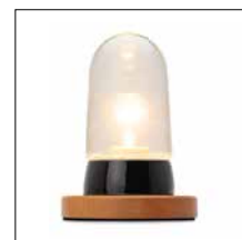
Table lamps Page 13-15