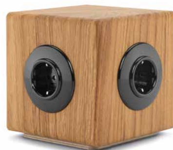
Power cube THPG (page 26)