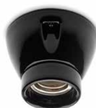
Ceiling socket THPG MINIMAL porcelain black

Straight three-piece porcelain socket with shade holder. Max. Ø 75 mm. Height 60 mm. Weight 200 g. Product code 152643