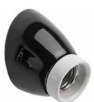
Wall socket THPG MINIMAL porcelain black, with white shade holder

Bevelled three-piece porcelain socket with shade holder. Max. Ø 75 mm. Projection 85 mm. Weight 200 g. Product code 152651