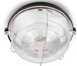
Basement lamp THPG Bakelite round Ø 200 mm, height 100 mm. Weight 1000 g. Porcelain socket E27, max. 100 W. IP54. Product code 100499