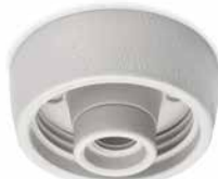
Ceiling-mounted base THPG porcelain M Ø 108 mm, height 60 mm. Product code 177026