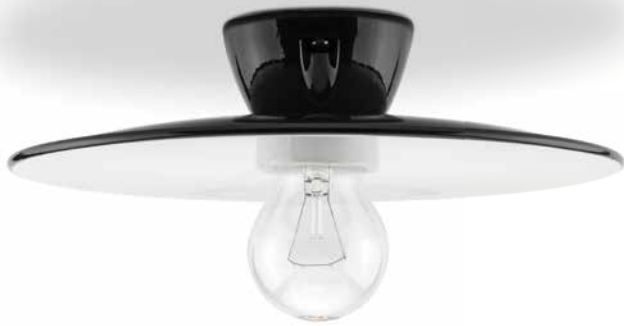
Ceiling socket MINIMAL porcelain b/w (152655) with Shade enamelled sheet steel black large (101088)